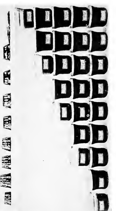
FIGURE 2.--Effect of Increasing Proportions of Sugar on Consistency and Yield of Blackberry Jelly. Left to right: sugar increasing from onefourth cup per cup of juice to 21/4 cups per cup of juice

FIGURE 1.—Consistency and Yield of Jelly from Various Extractions of Ripe Blackberries. Left to right: Extraction 1; Extraction 2; Extraction 3; Extractions 1, 2, and 3; Extractions 1 and 2; Extractions 1 and 3; Extractions 2 and 3